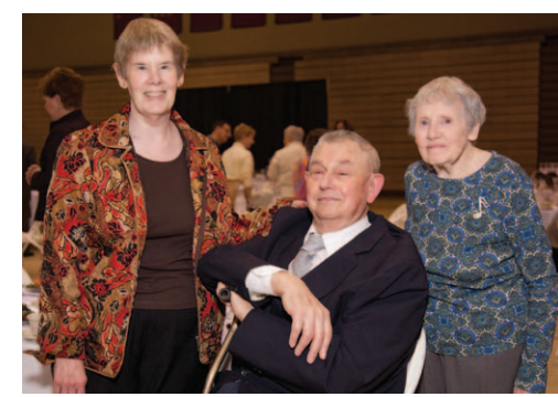
The Brown Family